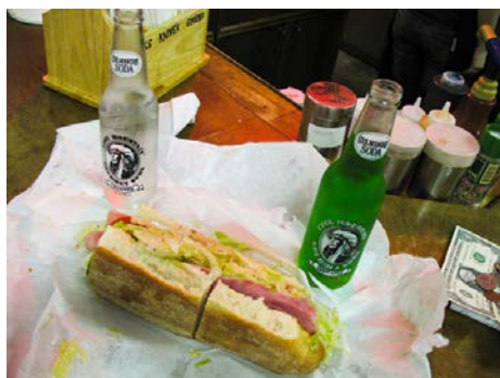
lunch at Mazzaro's counter

The Tampa Bay Chapter of the Public Relations Society of America (PRSA) was chartered in 1964. One of the state's largest professional organizations for public relations practitioners, we represent the Sunshine District's more than 160 members located throughout West Central Florida.